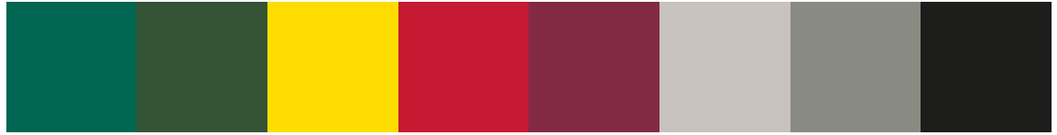
emerald green bottle green primrose cherry red burgundy new silver grey dove black