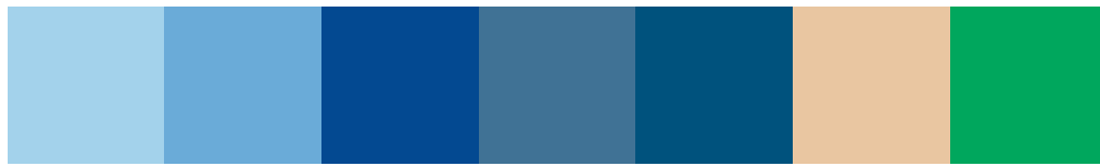
hyacinth* pacific medici steel blue ink navy beige* quince green