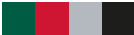
forest* flame platinum eclipse