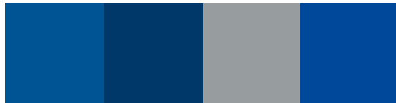
aegean* royal storm electric blue