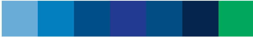
wedgewood blue blueberry* cornflower* royal blue regal blue BA navy quince green