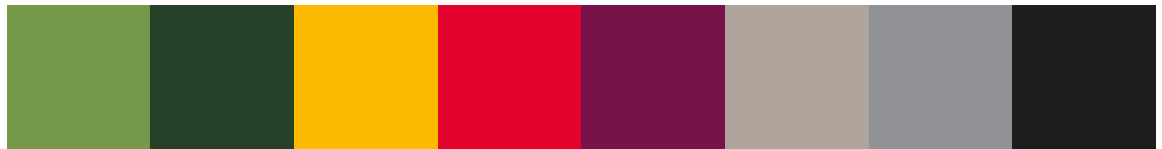
emerald green bottle green saffron plasma red dark wine new grey gunmetal black